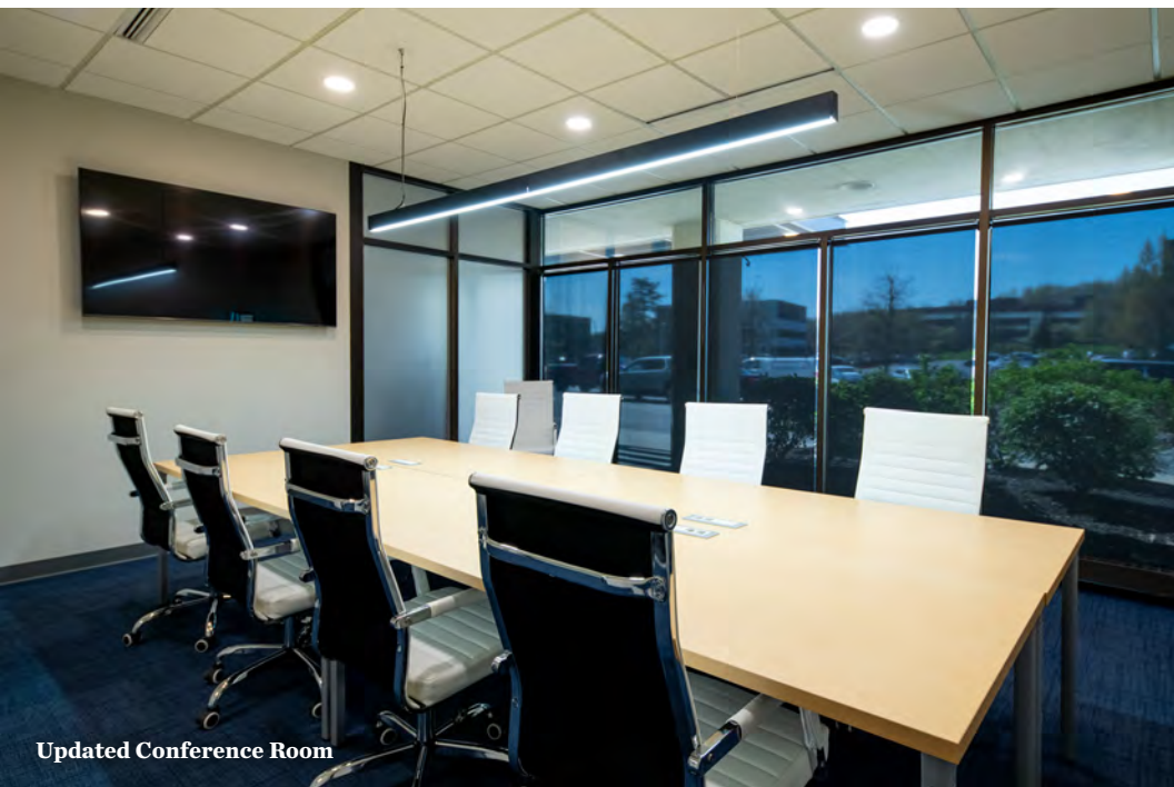
Updated Conference Room