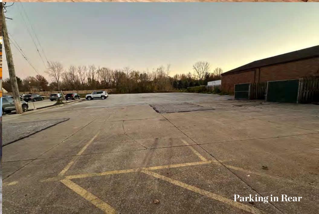
Parking in Rear