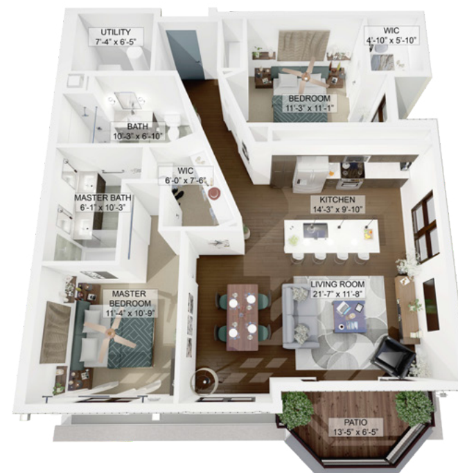
2C Layout | 1,187 SF