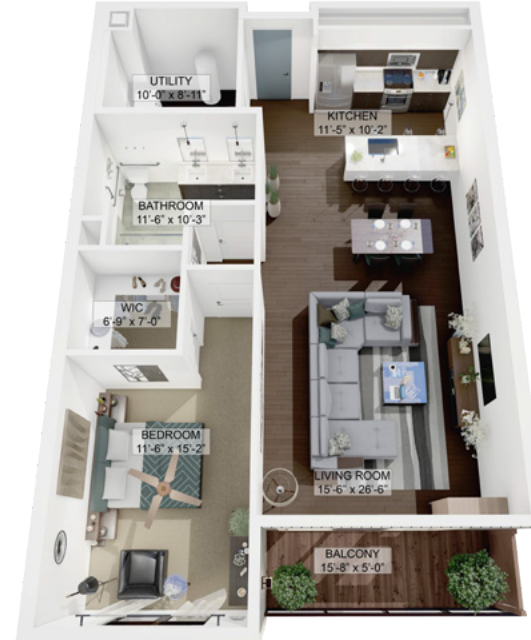
1ADA Layout | 1,151 SF