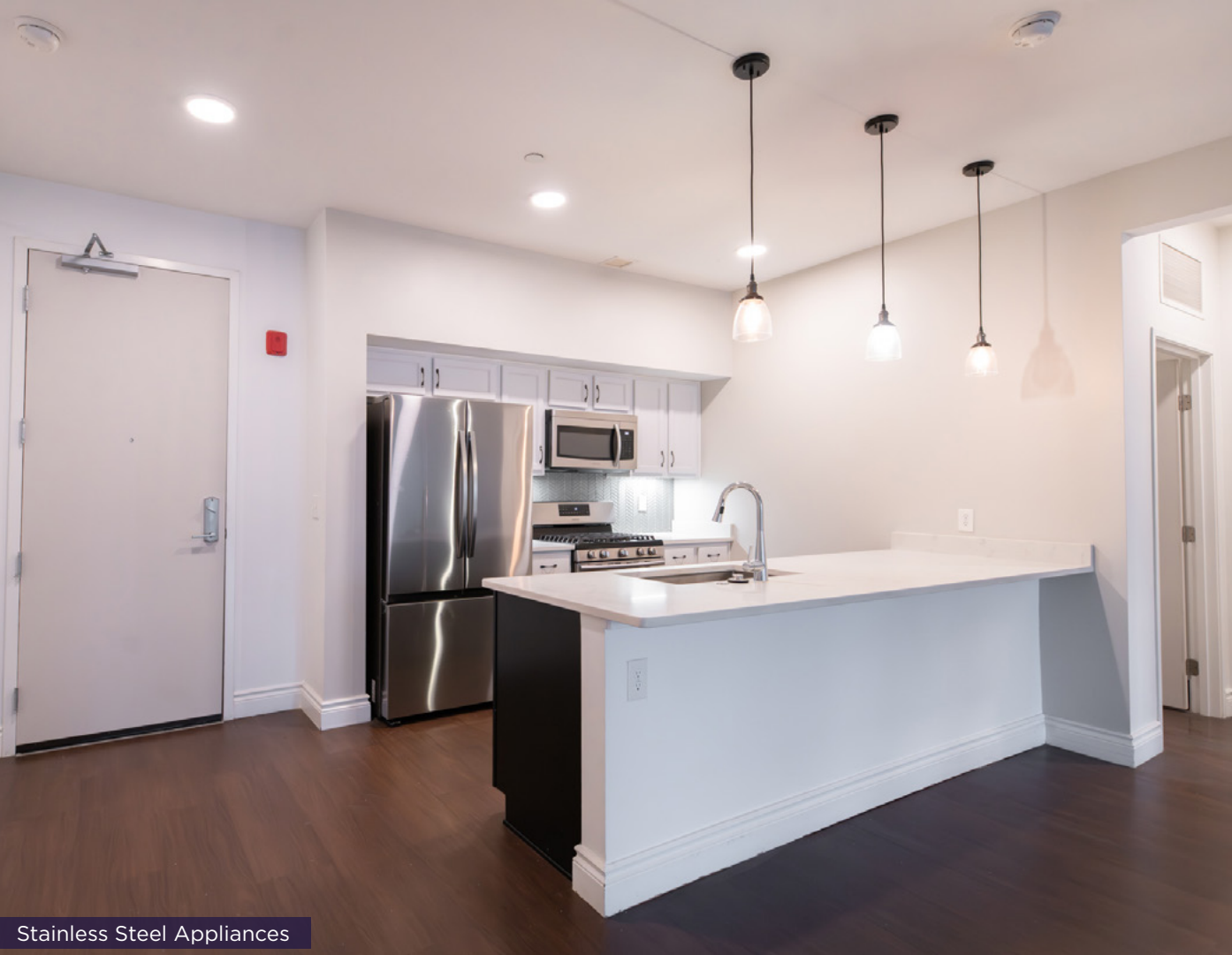
Stainless Steel Appliances