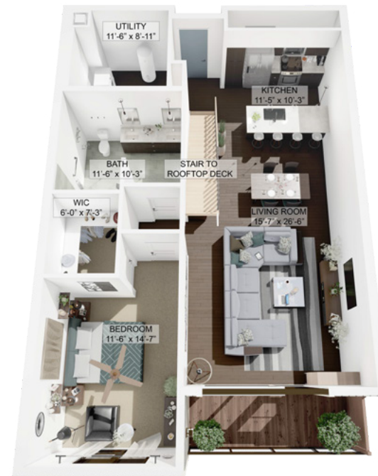
1C Layout | 1,228 SF