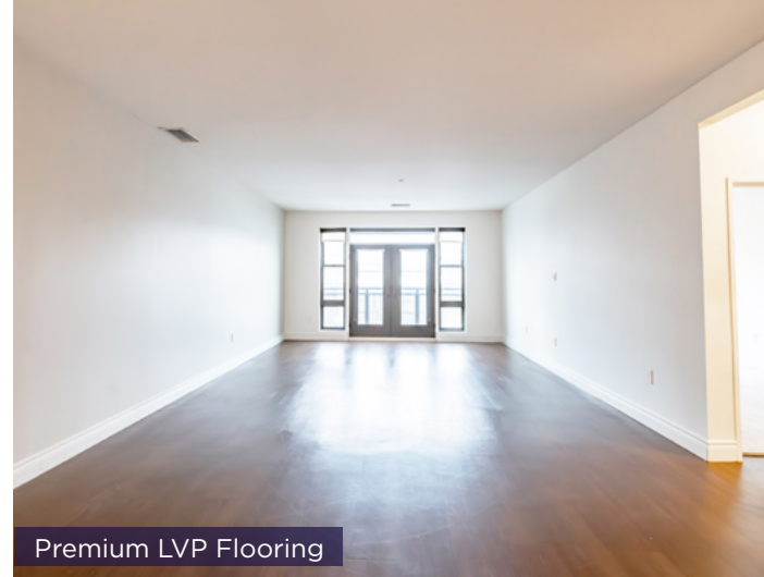
Premium LVP Flooring