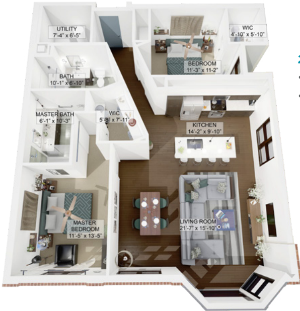
2A Layout | 1,364 SF