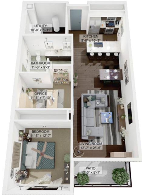
1A Layout | 1,045 SF