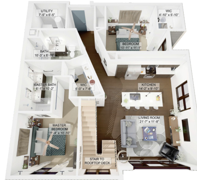
2E Layout | 1,264 SF