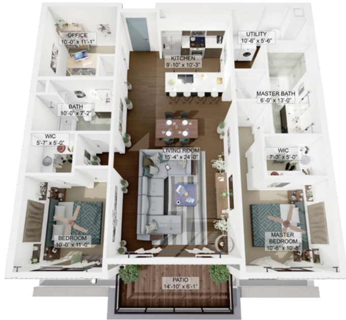
2D Layout | 1,363 SF