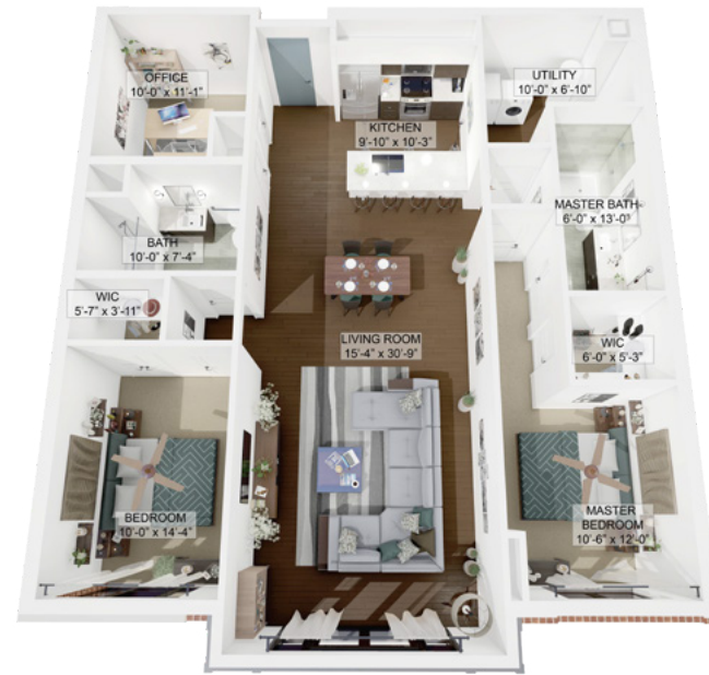
2ADA Layout | 1,541 SF