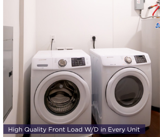
High Quality Front Load W/D in Every Unit