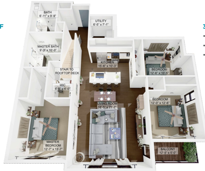
3D Layout | 1,708 SF