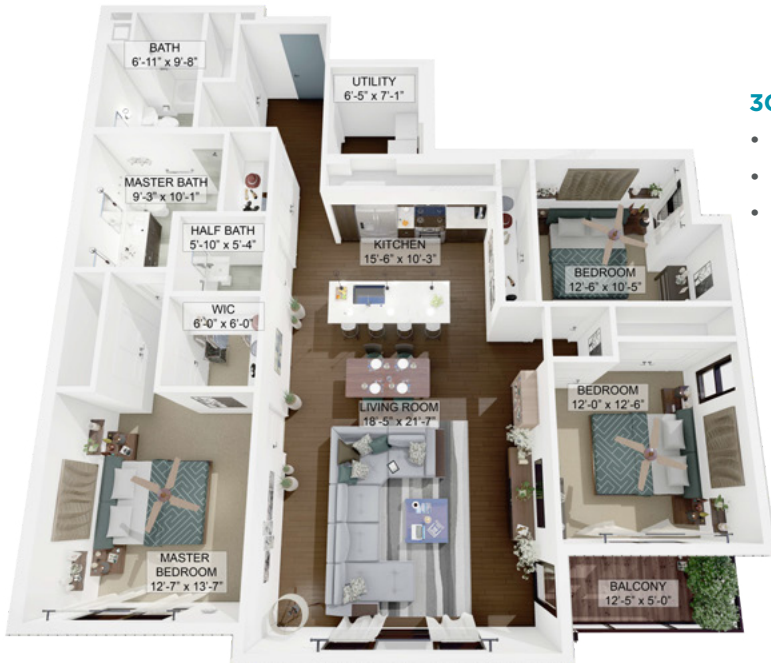
3C Layout | 1,631 SF