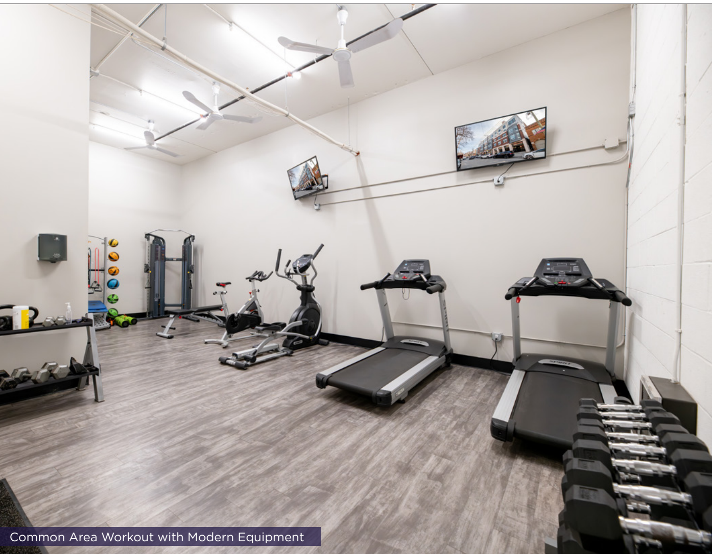
Common Area Workout with Modern Equipment