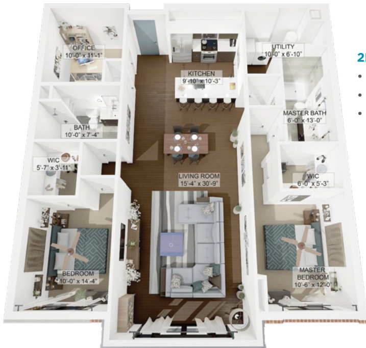
2B Layout | 1,541 SF