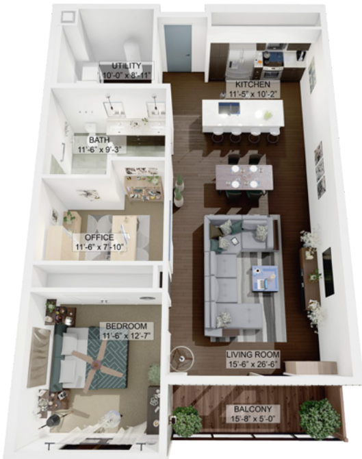
1B Layout | 1,151 SF