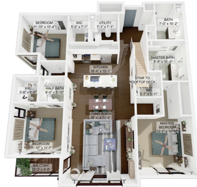
3B Layout | 1,740 SF