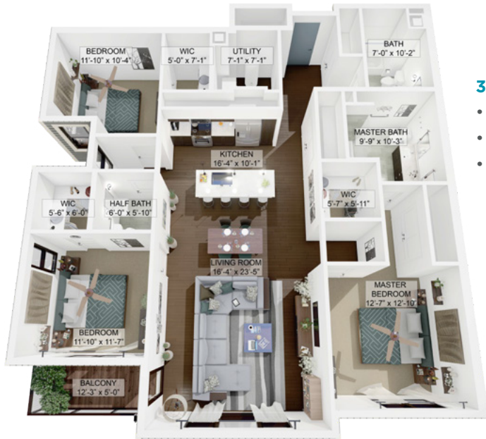
3A Layout | 1,663 SF