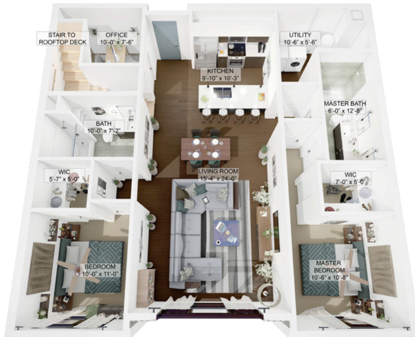
2F Layout | 1,440 SF